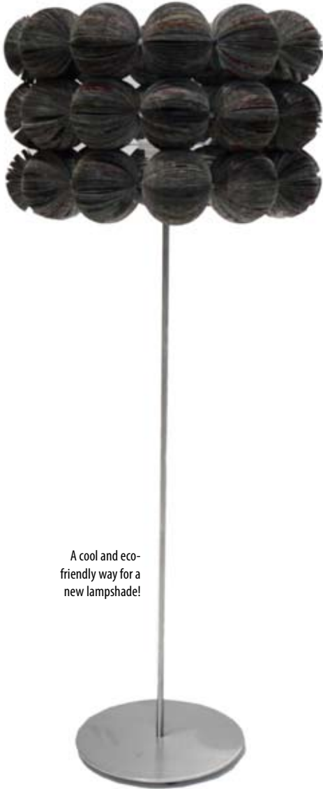
A cool and eco-friendly way for a new lampshade!