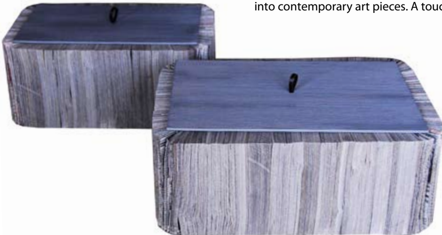
Storage problems? Solve that with these storage bins that also saves the earth!

These superheroes are not only strong, but have given a new meaning to the 75,000 trees that was needed to print a Sunday Edition of the New York Times. Find them at the Melandas Showroom, along with the rest of their eco-friendly collection!